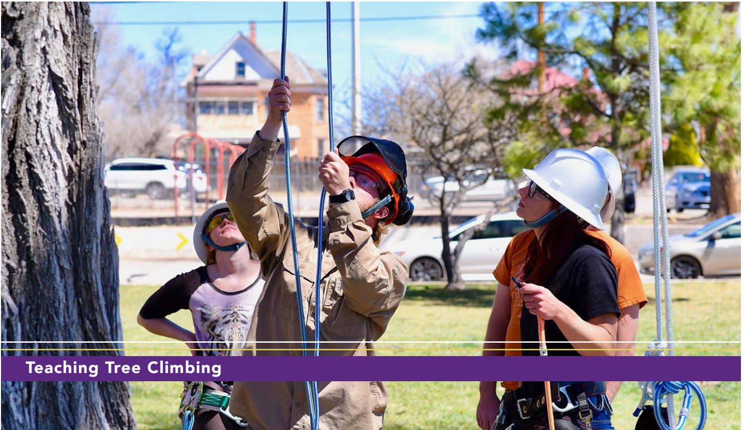
Teaching Tree Climbing